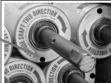
Industries Best Built Roller

"Tarp replacement time is dramatically reduced with the O'Brian roller line."